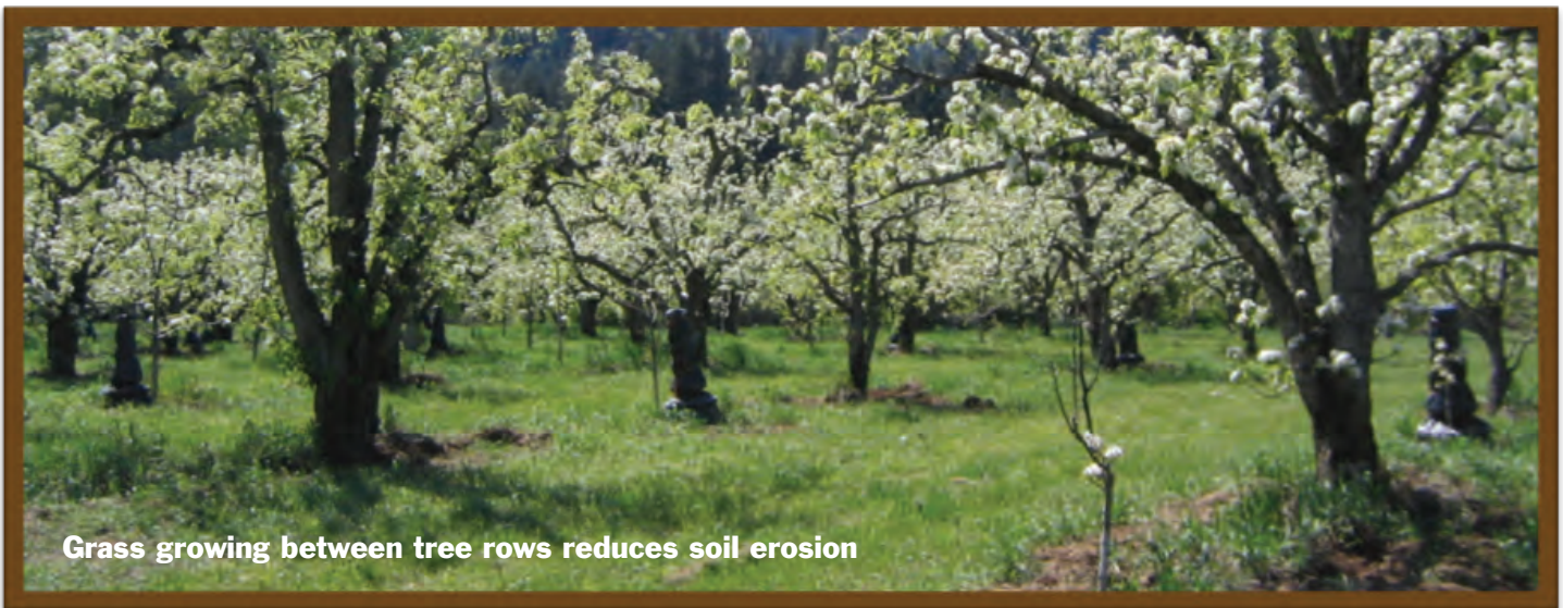
Grass growing between tree rows reduces soil erosion