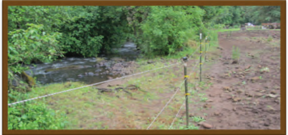
Livestock recently fenced out of a creek

Healthy streamside vegetation provides shade, stabilizes banks, filters nutrients and sediment, and provides fish and wildlife habitat.