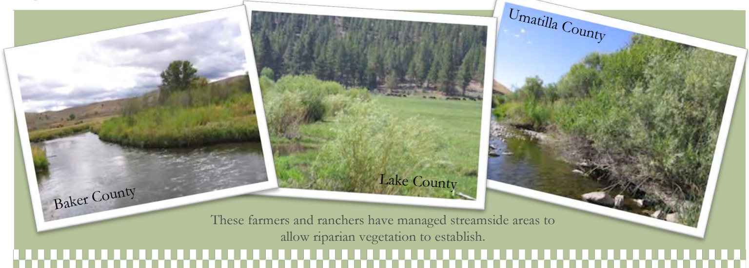
These farmers and ranchers have managed streamside areas to allow riparian vegetation to establish.

“Having a healthy riparian area can go a long way to having a sustainable and economically viable farming or ranching operation,” says Diebel.